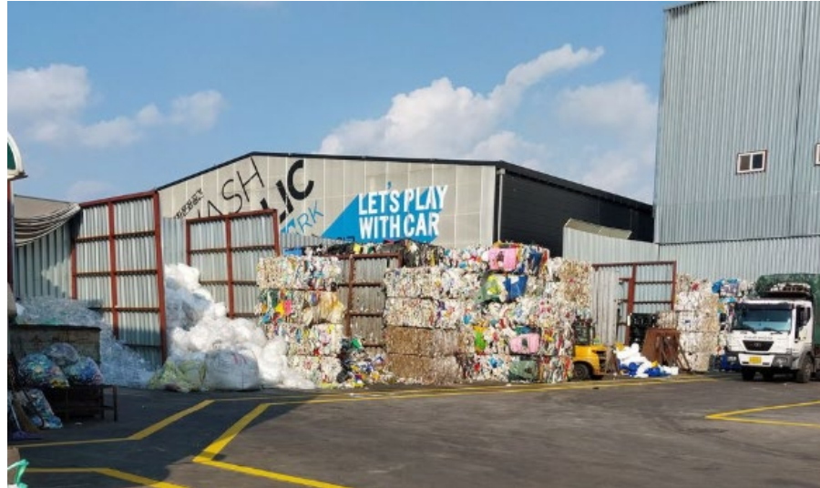
Sorting and Compressing Site