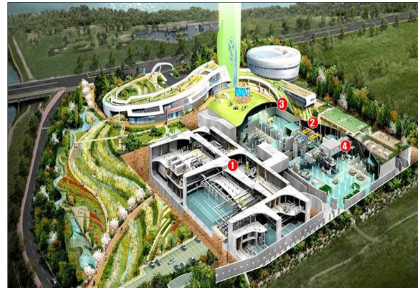
Day 3 Hanam Union Park

Underground Integrated Environmental Facility