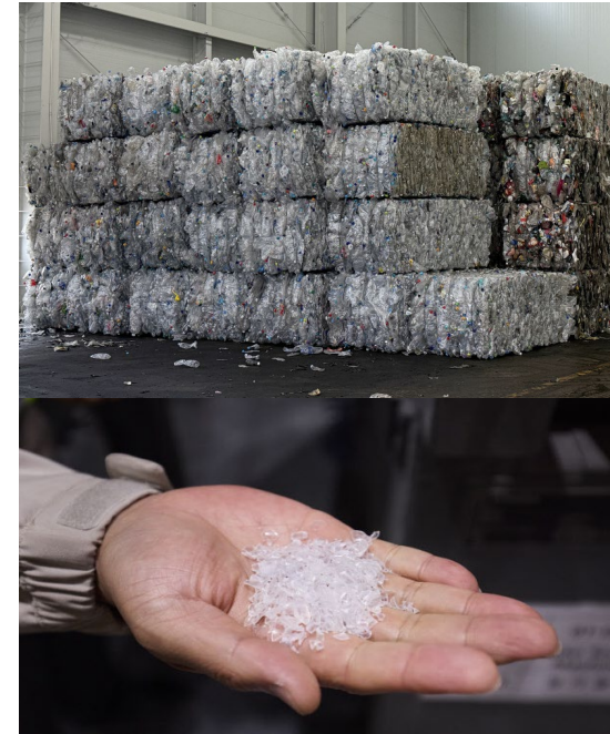
PET Recycling Facility