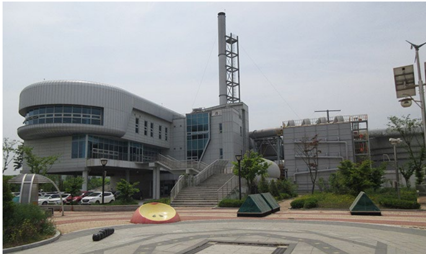
Day 4 Goyang Biomass Energy Facility