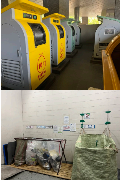
Source Segregation Point

Source Segregation – Collection&Transportation – Sorting- Recycling