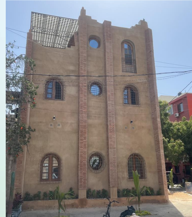
Urban application of agrivoltaic Solar House in Dakar, Senegal