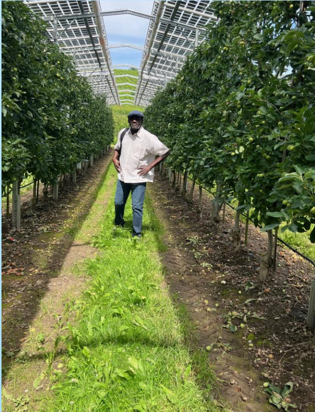
Visiting an agrivoltaic pilote project South Germany, june 2024