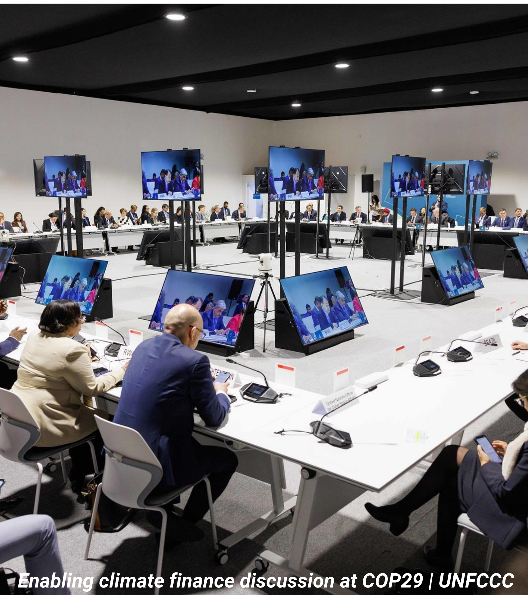
Enabling climate finance discussion at COP29 | UNFCCC